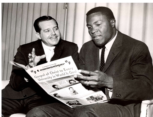
Cru founder Bill Bright with Olympic decathlete Rafer Johnson.

Athletes can be a key factor in reaching others. Cru has realized this since its beginnings at UCLA in the 1950s. In the 1960s, Cru launched Athletes in Action, which reaches and equips professional and amateur athletes to serve in scores of countries. AIA's tremendous platform includes hosting the annual NFL-sanctioned Super Bowl Breakfast where the Bart Starr Award and the hope of Christ is presented. This year 60 people indicated decisions to accept Christ after the event and 200 more expressed interest in learning about the Christian faith.