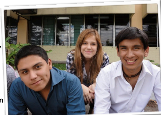
Right: students in El Salvador