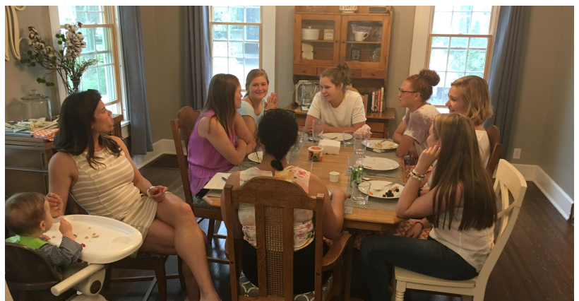
We hosted an Easter dinner with athletes from Lacrosse, Swimming, and Track

Find previous letters at www.ministryupdates.org/williams