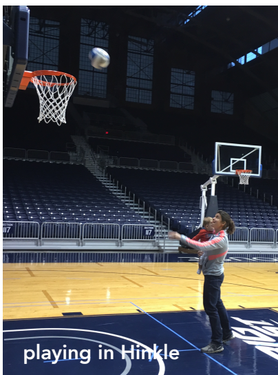
playing in Hinkle