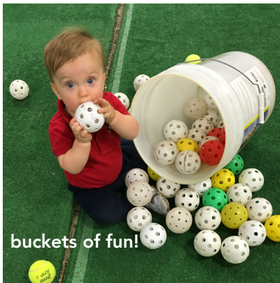
buckets of fun!