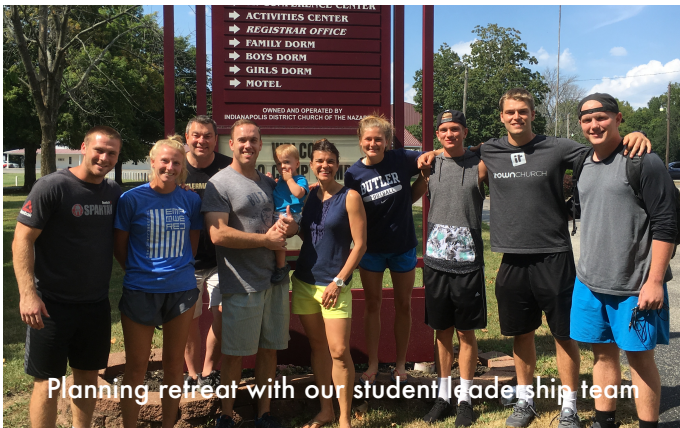
Planning retreat with our student leadership team