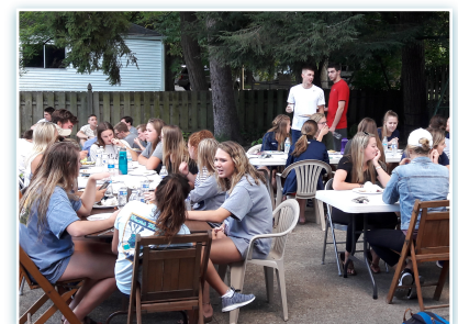
Athletes at the BBQ

We cherish your prayers for the large group meetings on Wednesday nights, that it would be a vehicle through which we build authentic community and grow in real faith. Thanks for your partnership in ministry!