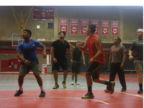
Playing basketball on campus helped us to build relationships with students and then share the gospel with them