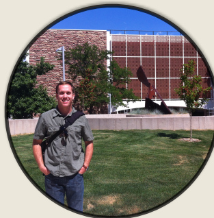
class on the CSU campus