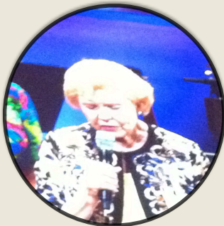
Vonette Bright praying for us