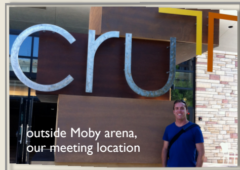
outside Moby arena, our meeting location