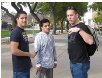
conversations with Latino students at Fullerton