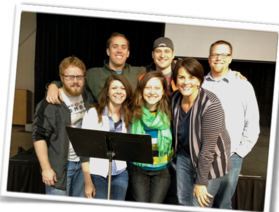
Left: my group of peers and coaches for the week