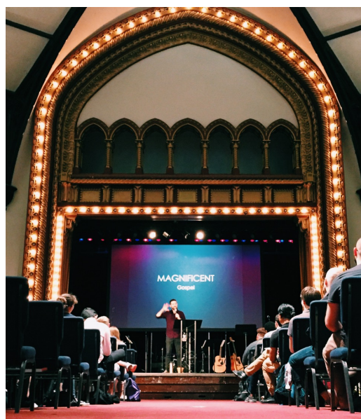
Thursday “Break Room” meeting