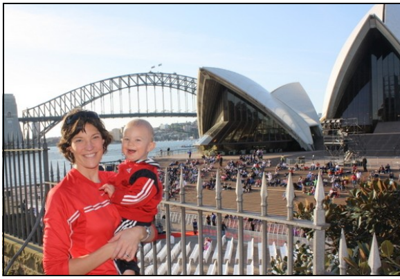
Hanging out at one of our favorite Sunday spots: Sydney Botanical Gardens.