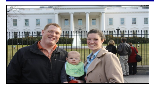
Team Wenig visiting the White House