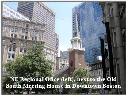
NE Regional Office (left), next to the Old South Meeting House in Downtown Boston