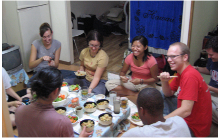
Sharing a meal together at the guys' apartment

After the initial craziness of moving in, we kicked off our official schedule with a day of much needed solitude with the Lord. Each of us came off of a whirlwind summer of support raising, packing and saying good-byes so we all needed to just sit at Jesus' feet to connect with Him. Obviously, daily connecting with Jesus is essential, but sometimes we need to pursue an extended time alone with Him, which is something that I've been convicted about in college.