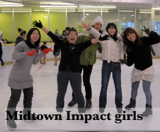
Midtown Impact girls