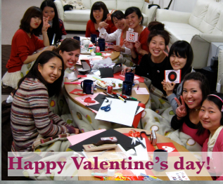
Happy Valentine's day!