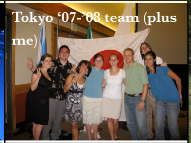
Tokyo '07-'08 team (plus me)