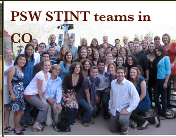
PSW STINT teams in CO