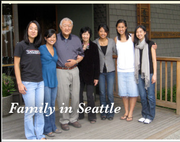
Family in Seattle