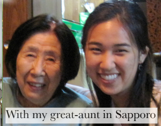
With my great-aunt in Sapporo