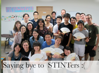
Saying bye to STIN'Ters :(