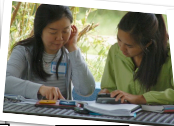
Aoi and me