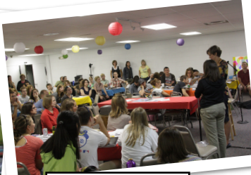
Xtrack in session