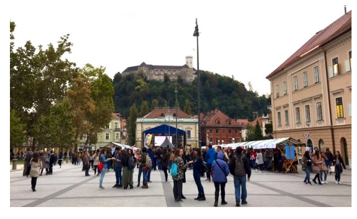
We're so grateful for the many of students we were able to meet at the involvement fair, pictured above in the center of the city.

Reaching Slovene students with the gospel through your partnership,