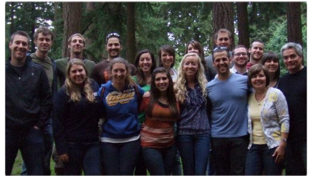
Cru staff members from the Great Lakes Region who are going all around the world to reach students for Christ this year.