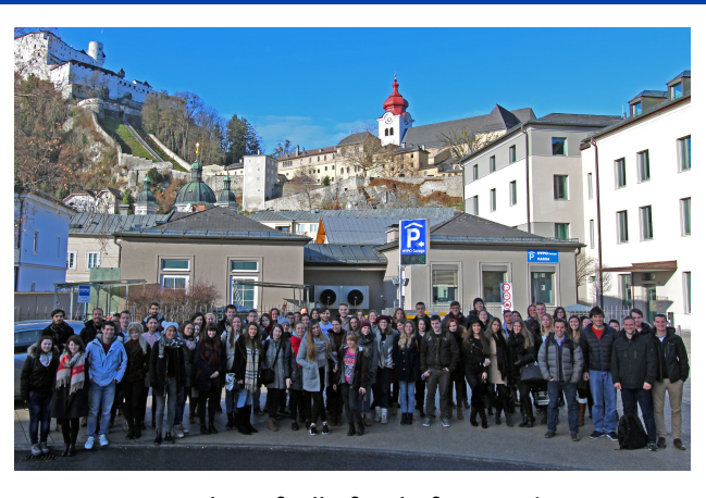
A group shot of all of us before setting out to explore Salzburg.