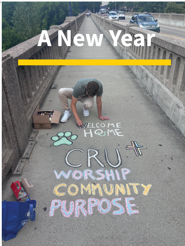
Students "chalking" on campus to advertise

"I don't have any religious background but I want to give faith a real shot." (Contin. on back)