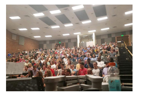
Students packed into Morton Hall 201 for the first 180 meeting of the year!