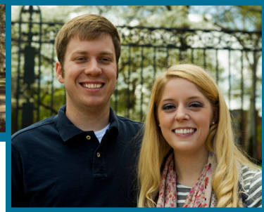
Cru at Ohio U January 28, 2015

Rachel scanned the room, looking for an empty seat. It was Saturday night of Winter Retreat, and everyone was taking advantage of the free time after the evening session to hang out and play games. Seeing an empty seat at a table of women, she made her way over and sat down.