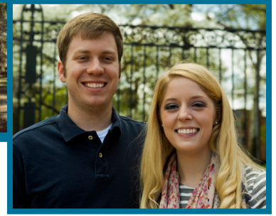
Cru at Ohio U July 31, 2015

A week ago, we attended Cru15 , the bi-annual staff conference held for staff with Cru in the U.S. It was, in two words, exhilarating and overwhelming. The conference is designed to be a time to bring all U.S. Cru staff together to refresh, revive, and refocus on our common mission. This year, we had four main focuses: