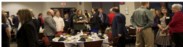
The table is set at our Executive and Leadership Entrepreneurial Forum

Last week at our Executive and Entrepreneurial Leadership Forum , three successful businessmen funded a catered meal to which we invited a number of top student leaders. They travelled to Madison to invest in these up-and-comers, offer their perspective on success, field students' questions, and talk about what really matters. I believe all 48 students were challenged that evening, with several saying they would like to know more about Cru or about the spiritual things addressed during the evening. Two even wrote that they were ready to receive Jesus!