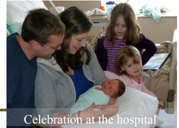
Celebration at the hospital