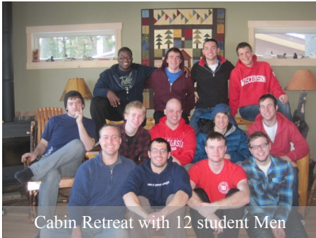
Cabin Retreat with 12 student Men

disciples, and one of those is “association”, or simply spending adequate time with them. We opened God’s word,