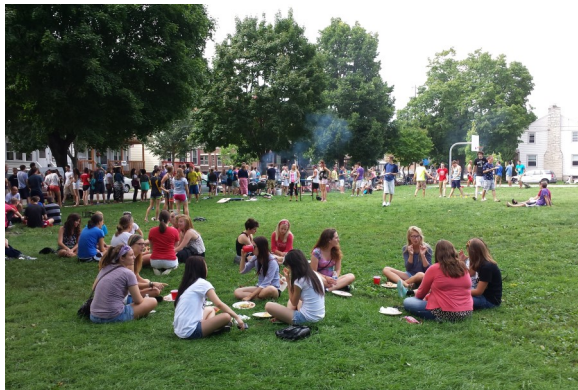
We did our best to be ready for the new class of freshmen that stormed campus.