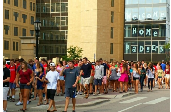
We hosted cook outs, give-a-ways, pizza gatherings, house parties, spiritual interest surveys and more to meet students.