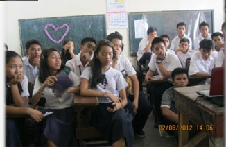
Our High school students Watching Creation vs Evolution

My dearest backbone of the ministry gets the opportunity to give her testimony to her home church on the anniversary from the point of salvation to her ministry now for the Lord. Well done, Honey.