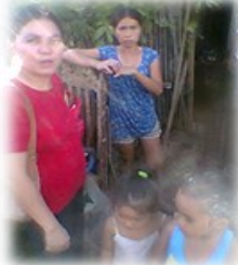
My wife & I visit some victims distributing water