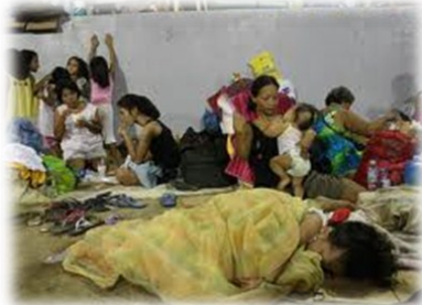
Where to sleep 4 now? The house washed out in the river