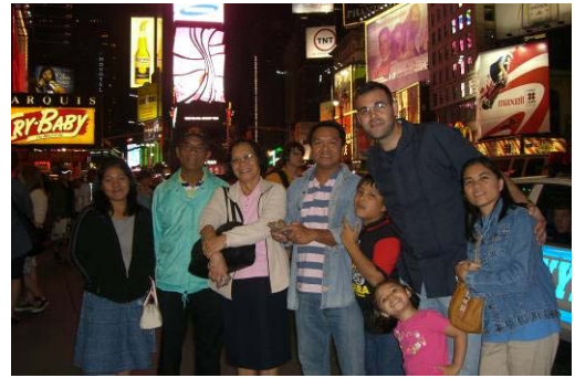
Fellowship with visiting missionaries & partners in the ministry to Mindanao