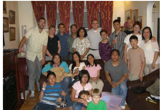
Local bible study fellowship with our home church