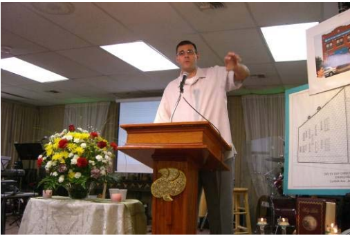
Presenting the need to a local church