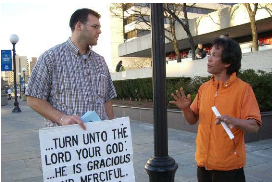
Witnessing the gospel to a Filipino during street preach ministry