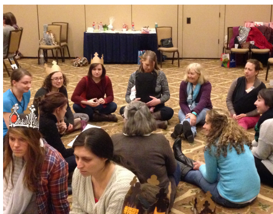
Debriefing in small groups. Some are sporting the “crown” of life.