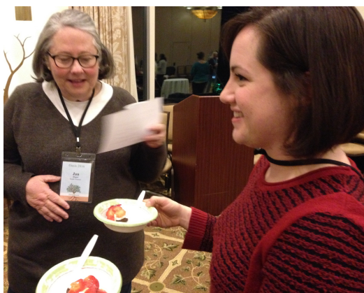
Trying to serve, but offering a sweet enticement rather than living water.