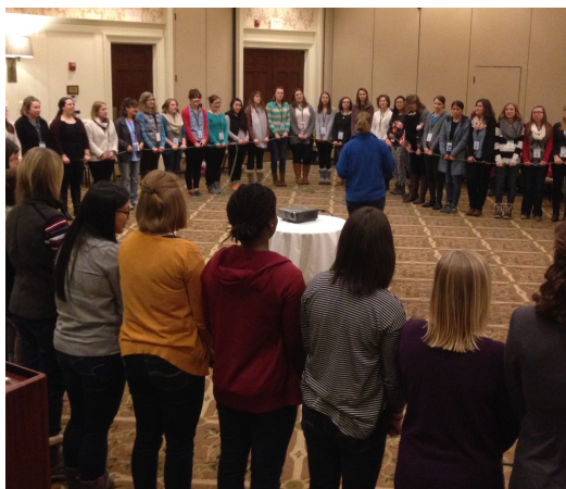
80 women do some group bonding.