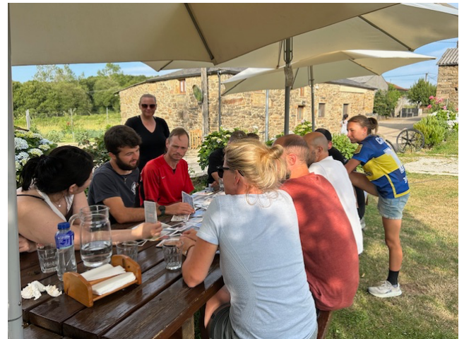
Pilgrims show the "answers" they chose to Soularium questions