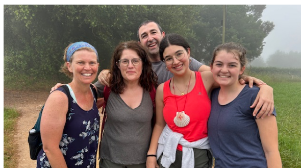
Making new friends from Spain as we hike