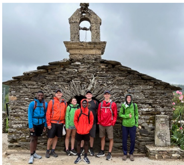
Tiny ancient churches dot the Camino