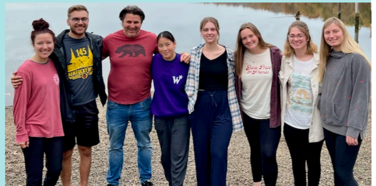
Seniors considering ministry after college

Last weekend I took 4 senior Buffalo students to a conference for them to explore what they are doing next in their lives. Our hope is that they would choose to intern for a 1 year (hopefully more) with Cru. They heard many great talks, and got to rub shoulders and ask questions of a lot of great staff. For me my favorite part being over 25 years older than most of the students that went was to just talk about life after college. We talked about a lot of topics like wrestling with what God might have for them after college, that it is possible to be a missionary and for God to provide for you, and no matter what you do after college how to reach the world for Christ. Would you pray for these students as they seek God for what He wants for them next year.