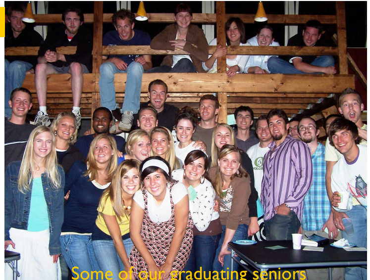
Some of our graduating seniors