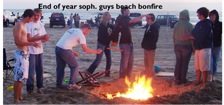
End of year soph. guys beach bonfire