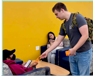
Handing out flyers

The Cru students at the University at Buffalo had a brilliant idea - a pumpkin painting party with games right before Halloween. They thought it would be a great way to invite their non-Christian friends to a fun night that would help build closer relationships. I thought it was a good enough idea to put up posters around campus and encourage Cru students to invite their friends to the event.