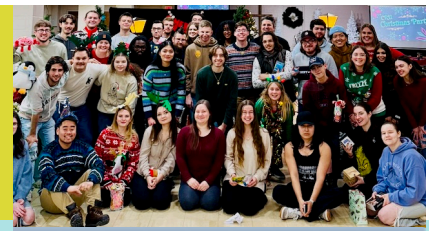
End of year Christmas Party

Cru Missionaries at Buffalo December 2024