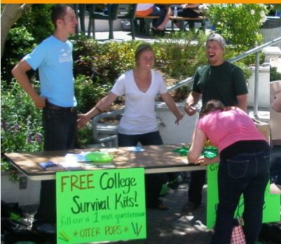
Cuesta Community College