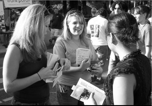
Freshmen filling out surveys—we use these to start our bible studies