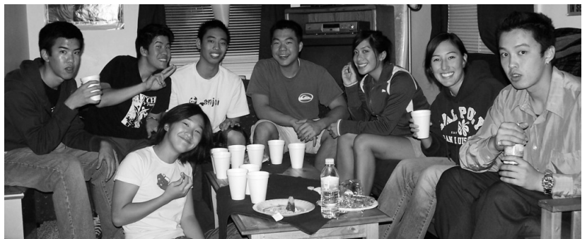
Epic put on a Korean BBQ outreach: 35 people came and heard the Gospel from one of their peers.