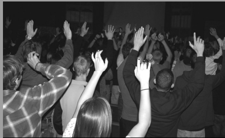
Over 500 students attended our Fall Retreat at Hume Lake: 5 received Christ