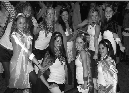
8 girls from Jenn's freshman study attended Fall Retreat!