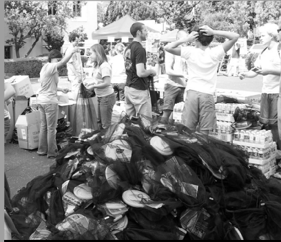
1 pile of Freshman Kits and we gave out 2500 this year