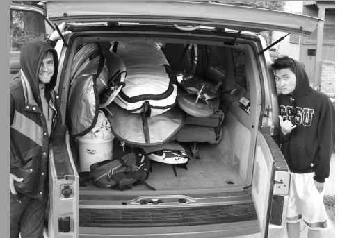
The Guys go surfing together