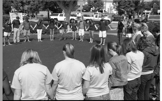
All of the campus Christian ministries praying together