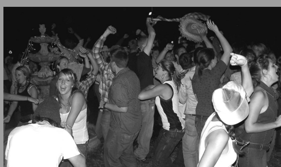
We threw a Barn dance to welcome the freshmen