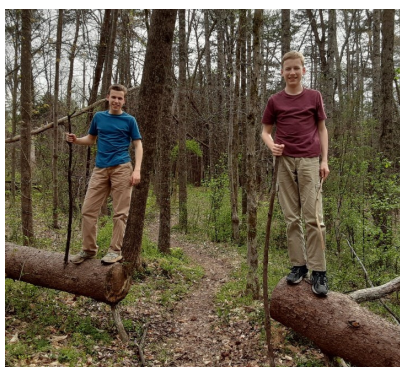
Boys on nature hike

Greetings in the name of our Lord Jesus Christ! We're pleased to share with you the wonderful things the Lord has been doing in our lives and ministry.