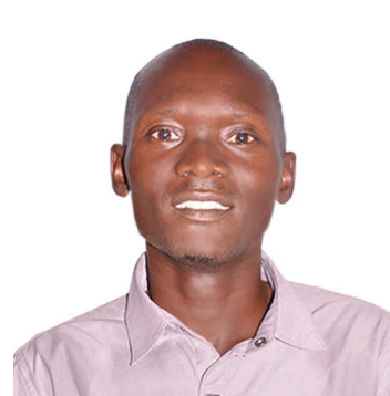
Yatta in Uganda