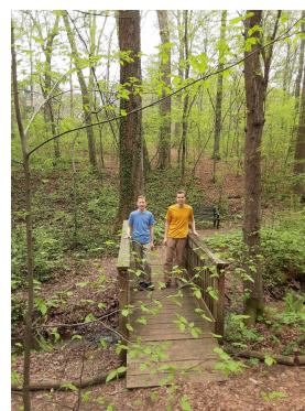
Boys in the woods

Family: In April, the boys took spring break from their home school studies, which they are currently enjoying. One of their outings was a lovely walk in the park together.