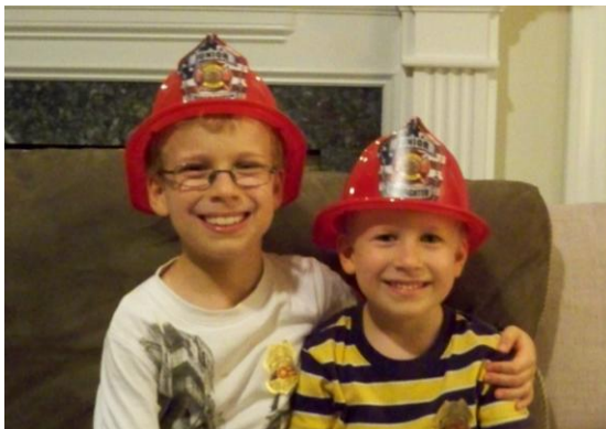
The junior fire fighters