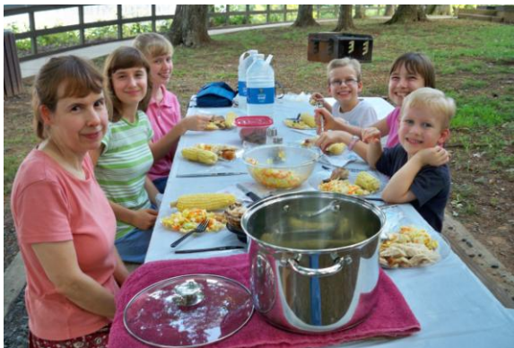
The family picnic at the lake

Family: In August, during bedtime devotions, as we were all seated around the living room coffee table, praying, the large glass globe of the ceiling light fixture fell off and crashed on the coffee table in the middle of the room. When it hit the coffee table, it exploded and extremely hot glass flew in every direction. The shattered glass pieces ranged from tiny fragments as small as dust and splinters all the way up to large, jagged pieces. Miraculously nobody was even slightly injured or touched by the glass. Thank the Lord!