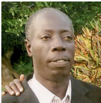
Grace in Uganda