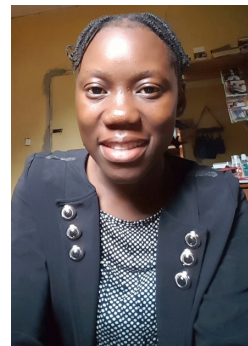
Tilia in Liberia