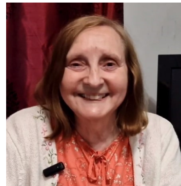
Catherine in England