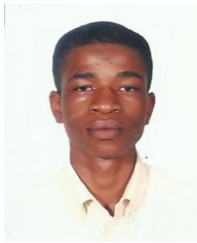
Christian in Nigeria