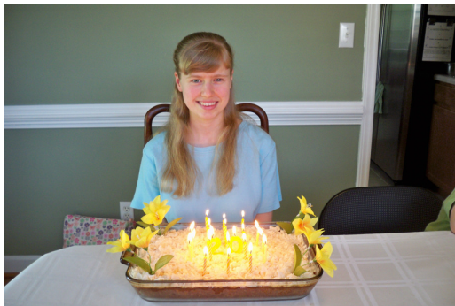
Charity turns twenty

Greetings from North Carolina in the name of our Lord Jesus Christ! We're pleased to share with you what the Lord has been doing in our lives and ministry.