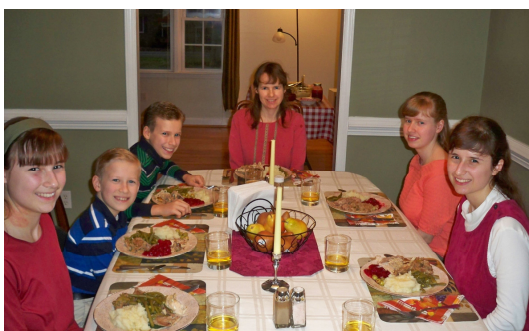
The family at Thanksgiving dinner

Greetings from North Carolina in the name of our Lord Jesus Christ! We're pleased to share with you what the Lord has been doing in our lives and ministry.