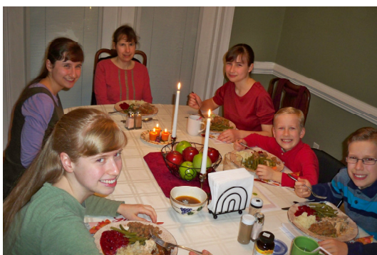
Thanksgiving Dinner 2017

Greetings from North Carolina in the name of our Lord Jesus Christ! We're pleased to share with you what the Lord has been doing in our lives and ministry.