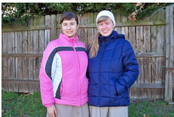
Hope and Charity

Greetings from North Carolina in the name of our Lord Jesus Christ! We're pleased to share with you what the Lord has been doing in our lives and ministry.