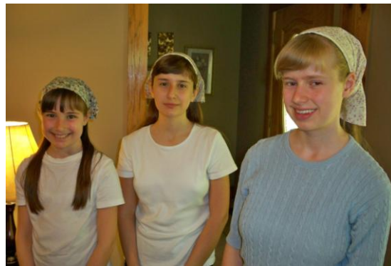
Faith, Hope, and Charity

In home school, the children finished taking standardized tests, and they all did fine. They have been enjoying their time playing outdoors in the sun, getting plenty of fresh air. They've made new friends with an American missionary family based in Chile and another family here from South Africa that has recently moved into this community. They have been exchanging missionary stories with each other and are getting along very well.