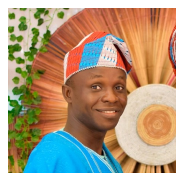
Deji in Nigeria