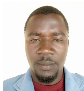
Max in Uganda