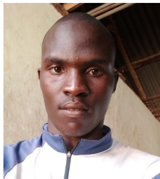
Stanley in Kenya