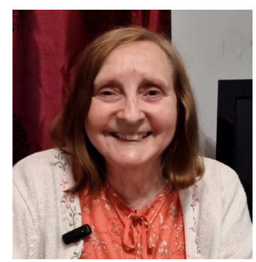
Catherine in England